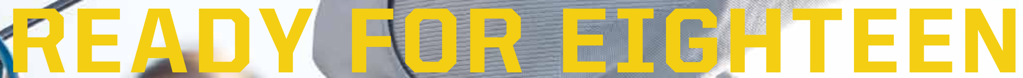
Tony Finau PGA Tour Pro

Ready is all or nothing. We either are, or we aren't. In the history of human endeavor, no man has ever achieved anything with almost. It's why we burn so many hours. It's why our muscles throb, it's why our eyes ache, and it's why we live with blinders on — in constant pursuit of preparedness. And we know that as much as we pride ourselves on our dedication, this alone is not enough. Plenty of people are dedicated. Our worthiest opponents are just as hardworking as we are. So if we ever hope to win, we need to work smarter. We must be ready.