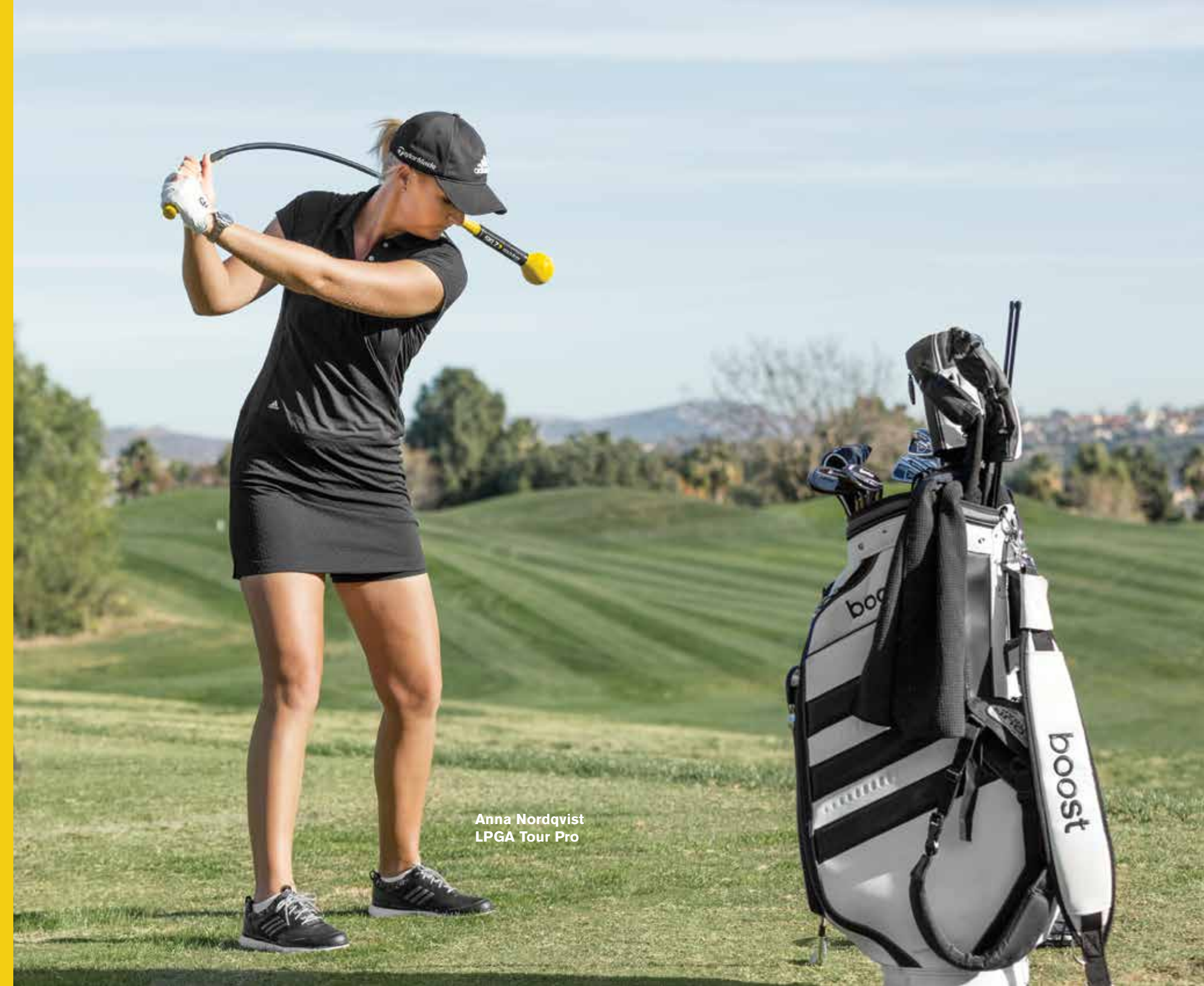
Anna Nordqvist LPGA Tour Pro