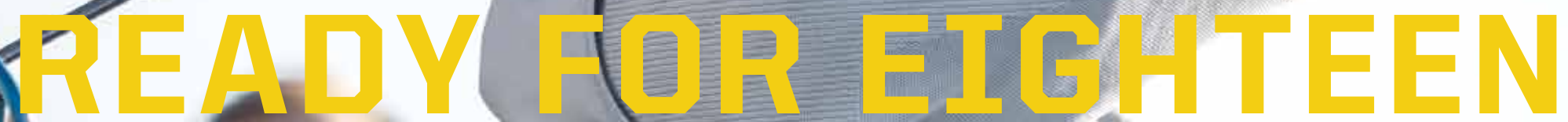
Tony Finau PGA Tour Pro

Ready is all or nothing. We either are, or we aren't. In the history of human endeavor, no man has ever achieved anything with almost. It's why we burn so many hours. It's why our muscles throb, it's why our eyes ache, and it's why we live with blinders on — in constant pursuit of preparedness. And we know that as much as we pride ourselves on our dedication, this alone is not enough. Plenty of people are dedicated. Our worthiest opponents are just as hardworking as we are. So if we ever hope to win, we need to work smarter. We must be ready.